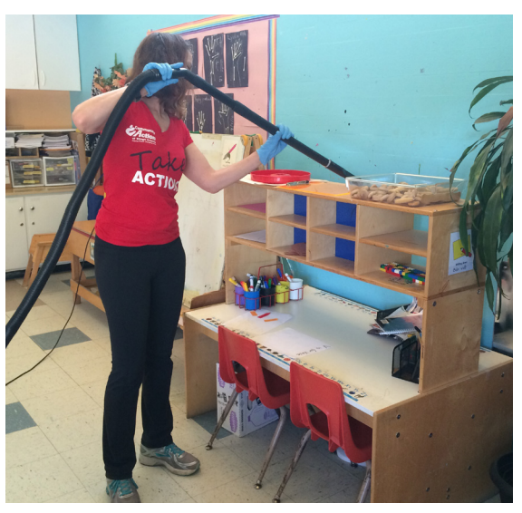
Researchers collected dust from seven Seattlearea childcares to test for toxic flame retardants.

Next, we took air and dust samples from each center, then replaced the mats with flame-retardant-free mats or cots. We waited three months, then took air and dust samples again.